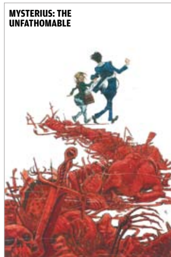
MYSTERIUS: THE UNFATHOMABLE

ratchets up all new arcs this summer beginning with two one-shots in May and June. The bloodletting continues when fan-favorite warrior Sven returns in July for “Sven the Immortal.” The only downside is it looks like our fan-fic third arc, “Sven the Disabled Grandpa,” is now erroneous!