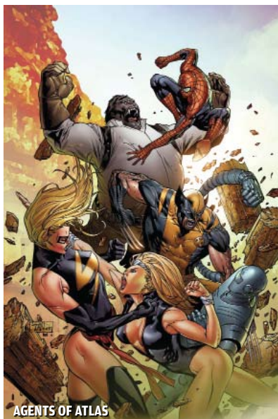
AGENTS OF ATLAS